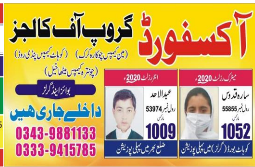
Figure 9 Oxford Group of Colleges Kohat

The owner of "Oxford Group of School and College" has used yellow colour in the background and various colours as semiotics devices for writing in the advertisement in Figure 9. The school advertiser has used pictures of top boys and girls along with their board roll numbers and marks in the advertisement.