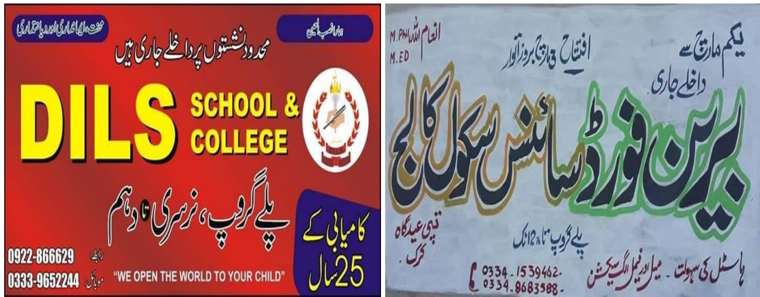
Figure 12 Advertisement by Dils School and College Figure 13 Advertisement by Brain Ford Science school

In the advertisement in Figure 13, the owner of 'Brain Ford Science School and College' has used blue colour as a semiotic device for the background and different colours for writing other kinds of information in the advertisement. He has used three different colours in the school name. The advertiser has used red colour to write the name of the school's managing director and qualifications. He also used red colour to write phone numbers in the advertisement.