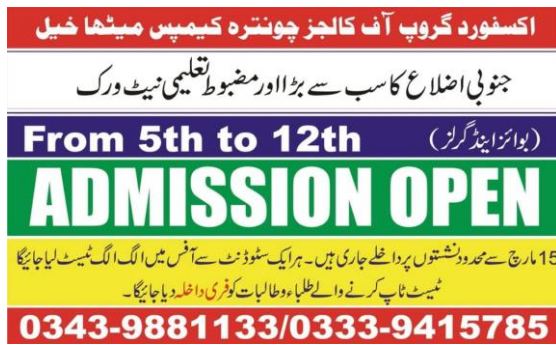
Figure 8 Oxford Group of College