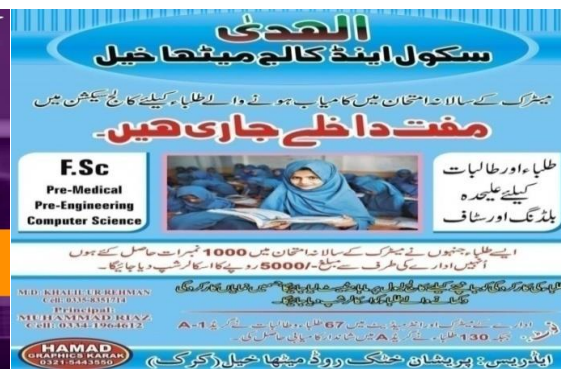
Figure 11 Advertisement by Al Huda School and College

The researcher can find female students' pictures and books in their hands in the mid-advertisement. Moreover, several female students sit on chairs in the advertisement's background.