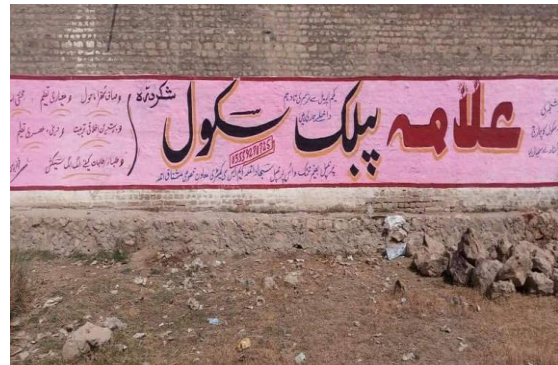
Figure 4 Advertisement by Quaid Inter College