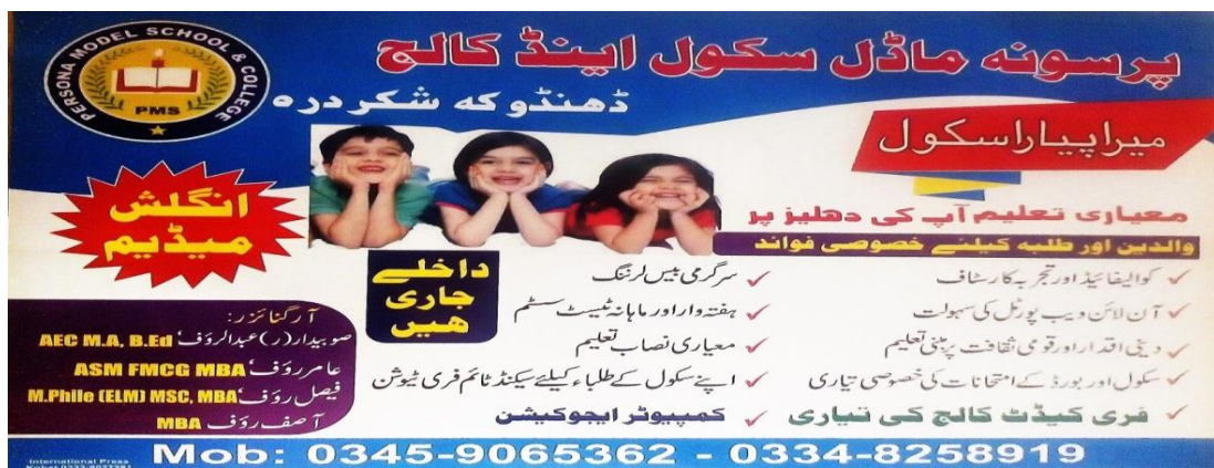
Figure 7 Advertisement by Persona Model School and College

A private school in Shakardara town, district Kohat, has given the advertisement in Figure 7. In this advertisement, the advertiser uses blue colour in the background and red and white colours to write the school name. The school's owner has given the school a monogram in the advertisement. Apart from that, we can also see pictures of beautiful small kids in the advertisement. The advertiser has used chiefly white colour for the background and black colour for writing other information in the advertisement.