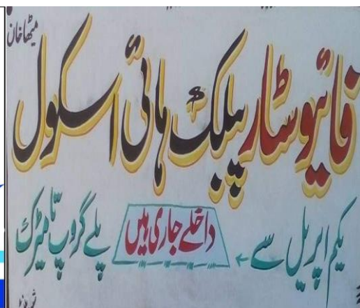
Figure 2 Advertisement by Rehber Education Services Figure 3 Advertisement by 5 Star Public School

In the advertisement in Figure 3, the advertiser has used a white background and different colours for writing. He has used red, yellow, and black colours in the school name, while for writing other things in the advertisement, he has used blue colour.