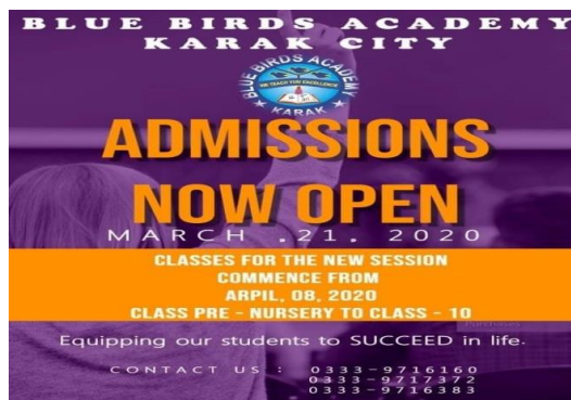
Figure 10 Advertisement by Blue Birds Academy

In contrast, in the advertisement in Figure 11, the advertiser has used a half-blue/sky colour as a semiotic device for the background. He also uses different colours to write other important information in the advertisement. He used black colour for writing things on a white background in the advertisement. He used black colour to write the school name. In addition, he used large fonts to write the school name.