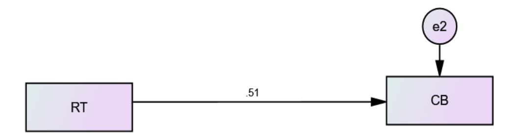
Figure 1: Direct Path

The below figure reveals the direct effect of EA with EM and indirect effect through EAL. Direct and indirect both relations are important in structural equation model.